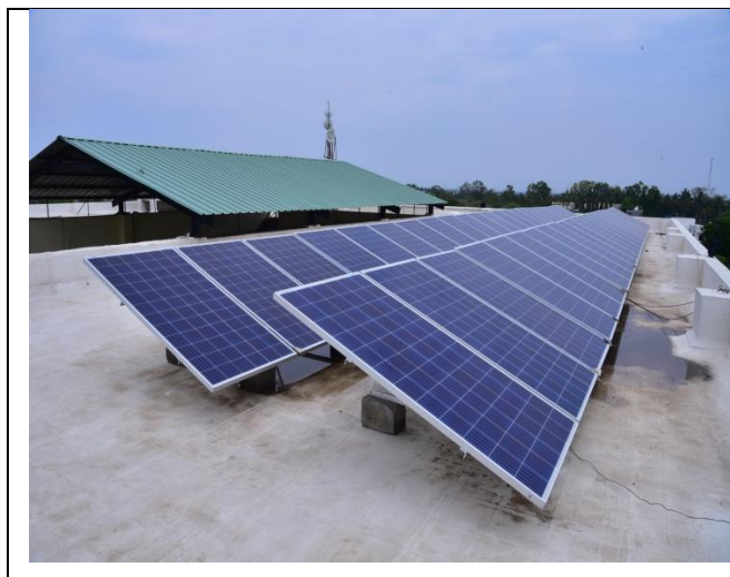
Solar Panel on Main Building