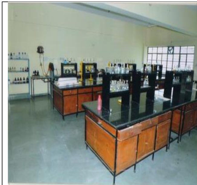
Science Lab (Chemistry Lab)