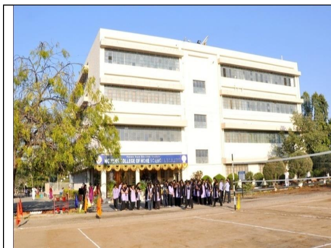
Institute Main Building

4.1.1 The institution has adequate facilities for teaching-learning. viz., classrooms, Laboratories, computing equipment, etc.