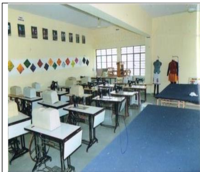
Garment Construction Lab