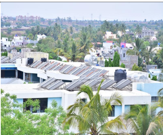
Solar Panel on Hostel