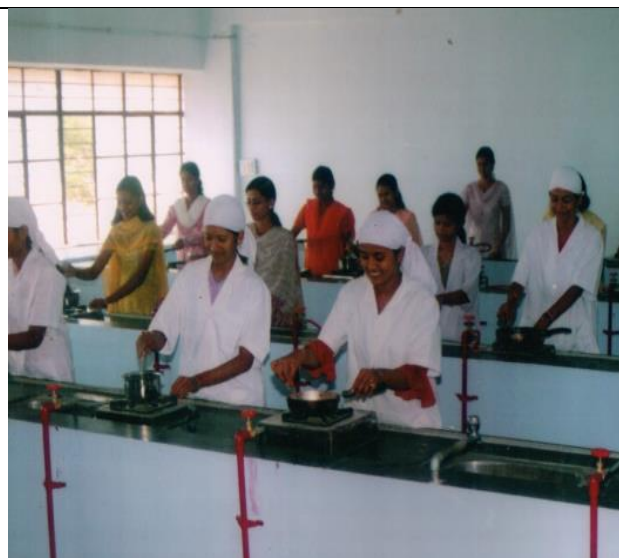
Food Science and Nutrition Lab